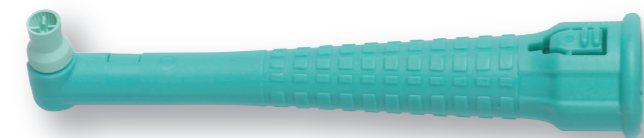
ēsa ST-Star Titan